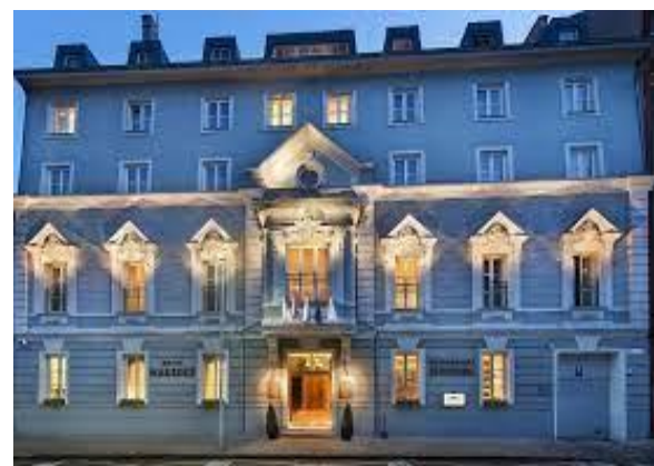
Marrol's Boutique **** Location: Downtown