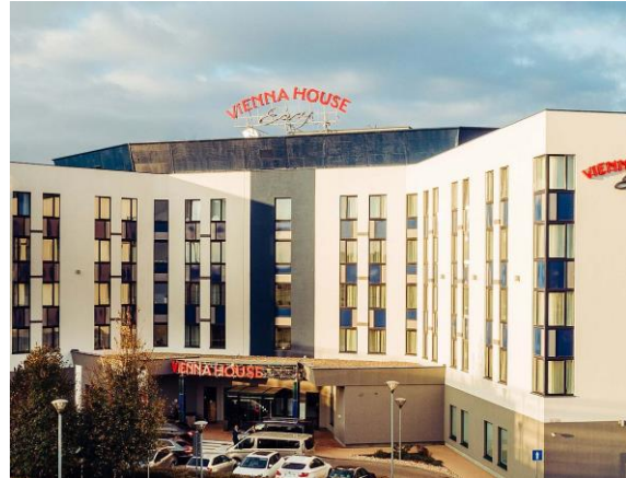
Vienna House Easy *** Location: Airport