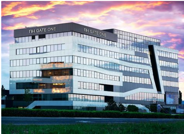
NH Gate One **** Location: Airport

Hotel rates are greatly fluctuating during the year therefore we have fixed rates during the whole year with our contracted partners to guarantee you the best prices. We shall gladly arrange hotel reservation on your behalf downtown or in the vicinity of the airport. We are happy to include the costs from our contracted hotels in your invoice.