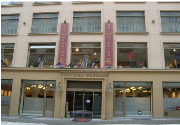
Art Hotel William**** Location: Downtown